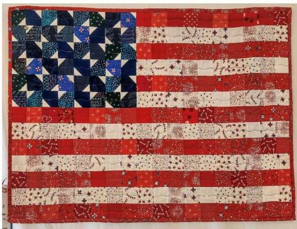
Monica Shafer She's a Grand Old Flag