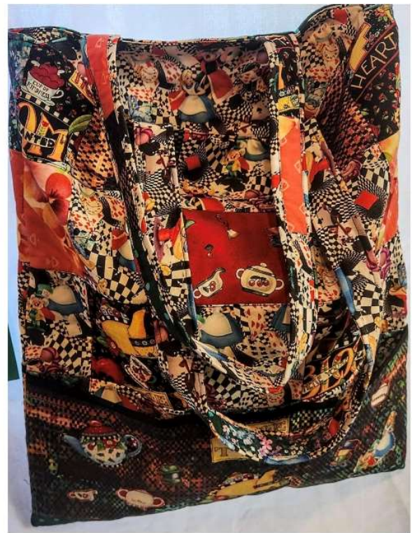
Annette Leinen Let's Face It - It's Never Too Late to Stop and Smell the Flowers and Sip a Bit of Tea