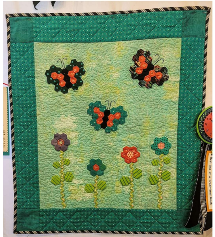
Diane Healy Butterfly Frenzy Best Use of Traditional Block