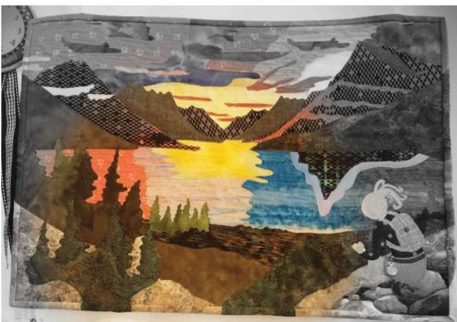
Odette Osantowski Dinner With a View Committee Choice