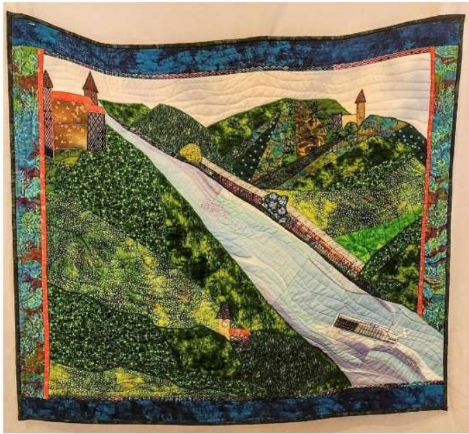
Hiroko Moriwaki Let's River Cruise