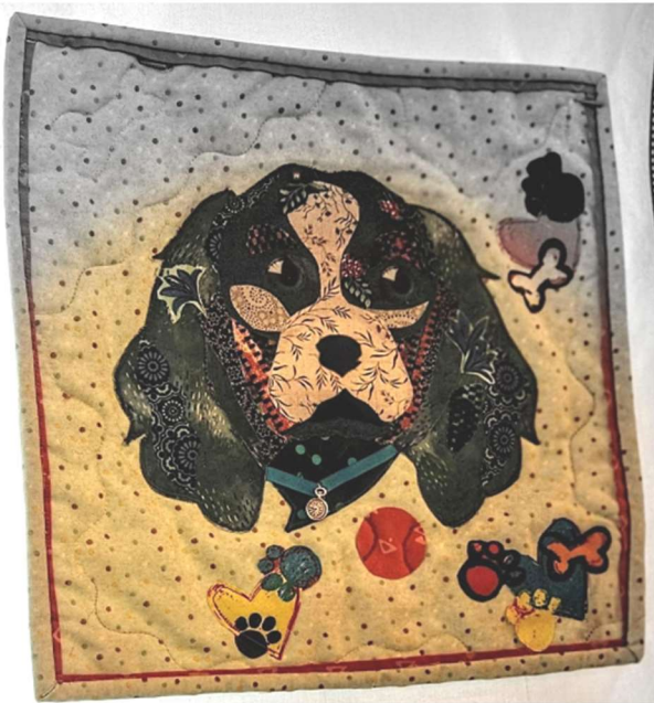
Janice Shaw Happy Face