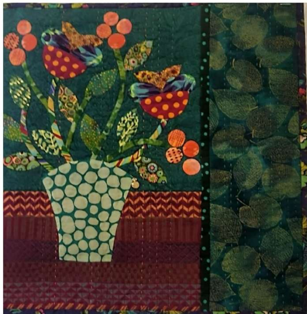
Holly Betz Let's Vase It Best Hand Quilting