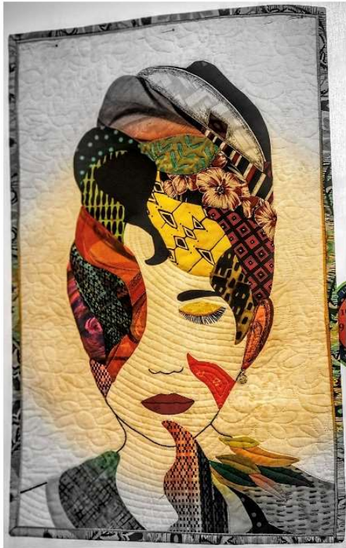
Pam Hadfield Let's Face It...I'm a Challenge Best Hand Appliqué