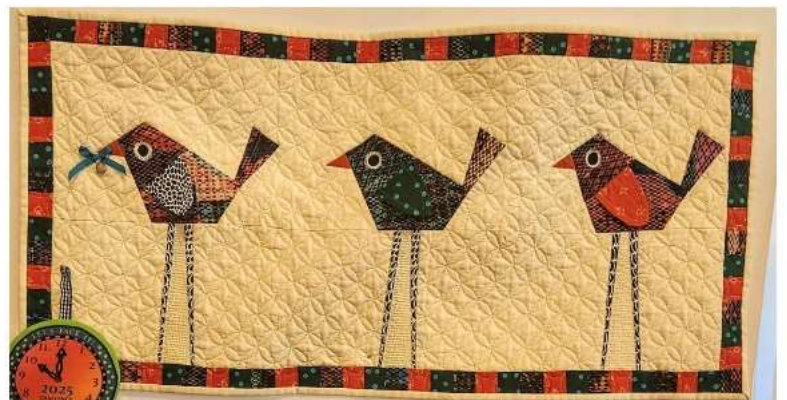
Vicki Slawson Birds of a Feather Flock Together Best Machine Quilting