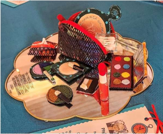
Phyllis Parente Put Your Face On