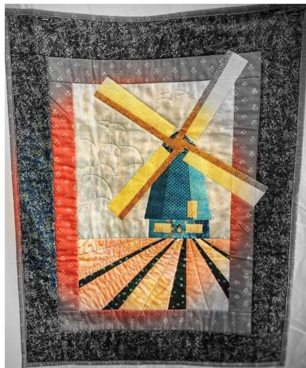
Donna Cox Fields of Gold