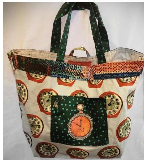
Vickie Janis Let's Face It, We Need to Shop for Fabric and Chocolate