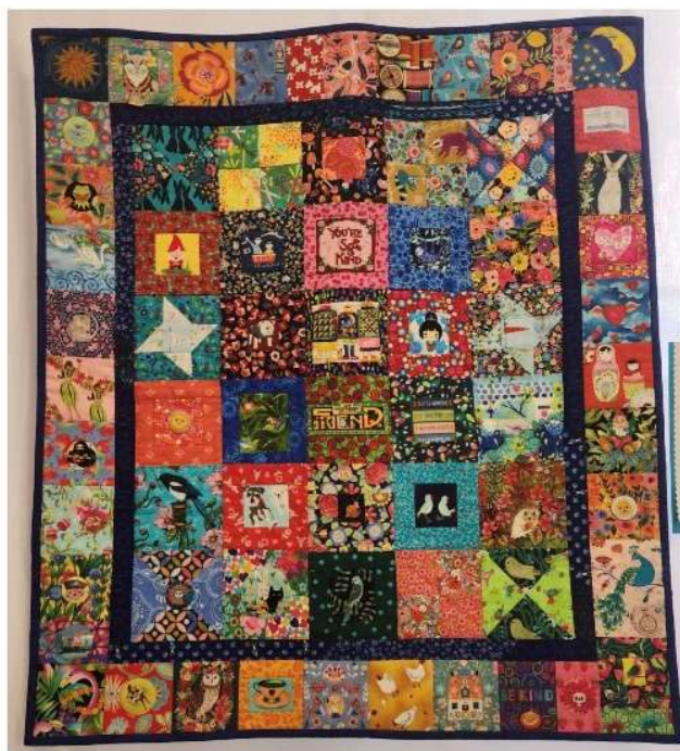
Lyndy Dye Fanciful Faces in Bloom