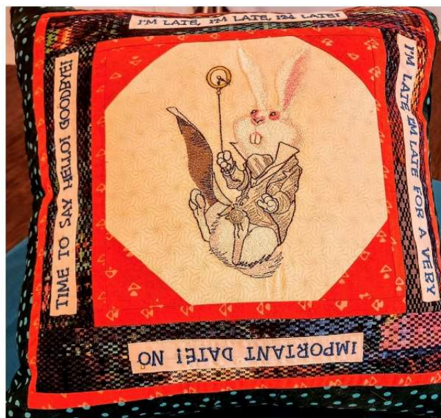
Patricia Reese White Rabbit Pillow